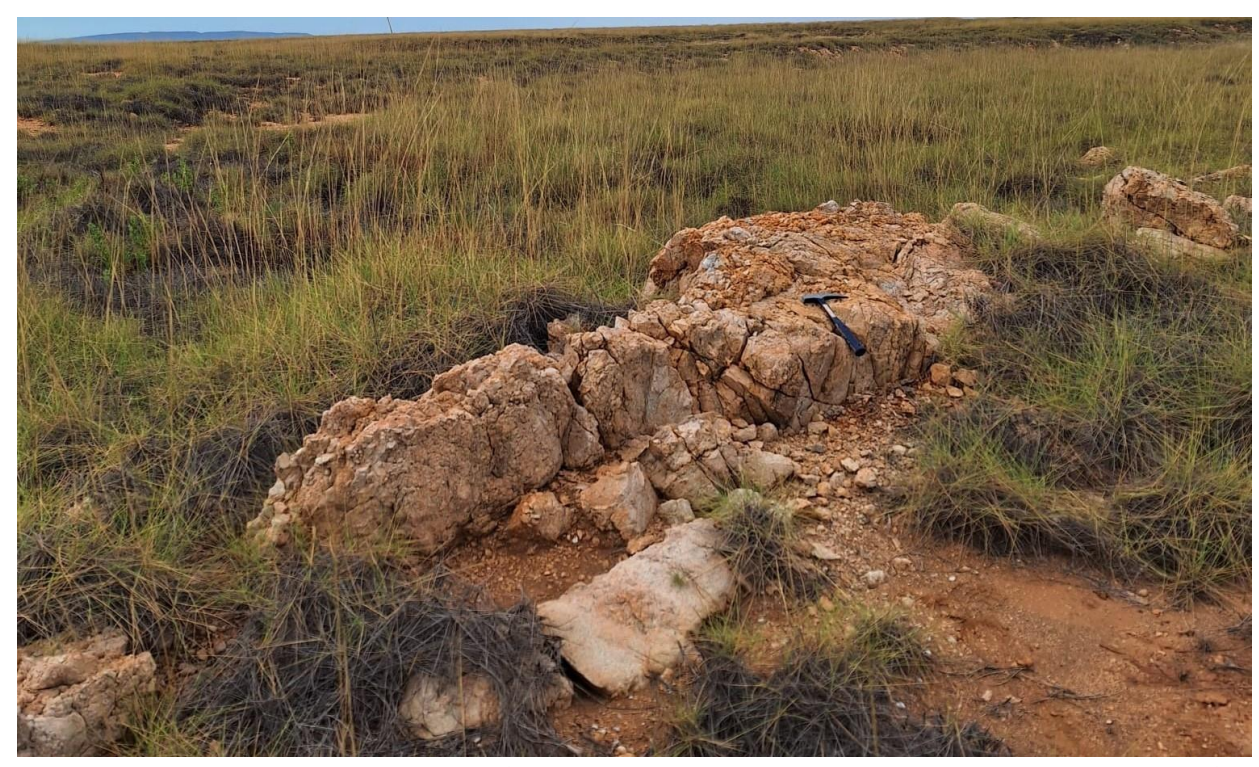
Image 1: Outcropping pegmatite in E47/4990 (location SR00395: 566322mE; 7703865mN - see location, Figure 1).

■ The Andover pegmatites outcrop at surface, whereas the Andover East targets, identified in magnetics on the Sherlock Bay tenements, lie under-cover and have not been explored previously. Following grant of the new ELA's, detailed gravity and passive seismic geophysics will be carried out to define buried targets , prior to aircore drilling to test bedrock for lithium-pegmatite discoveries .