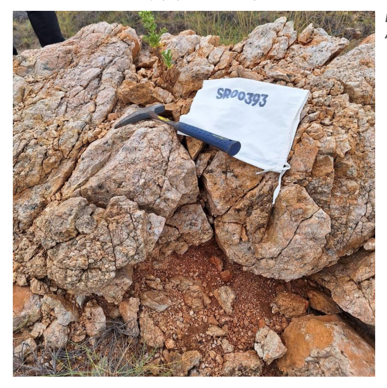
Image 2: Pegmatite outcrop on ELA47/4990 (see Appendix 1 for location and results, and Figure 1).

Aircore drilling to bedrock will then test these buried targets for lithium bearing pegmatites similar to the Andover pegmatite discovery, which lies within the same structural and intrusive corridor and is only 50km to the west of Sherlock Bay (Figures 1 and 2).